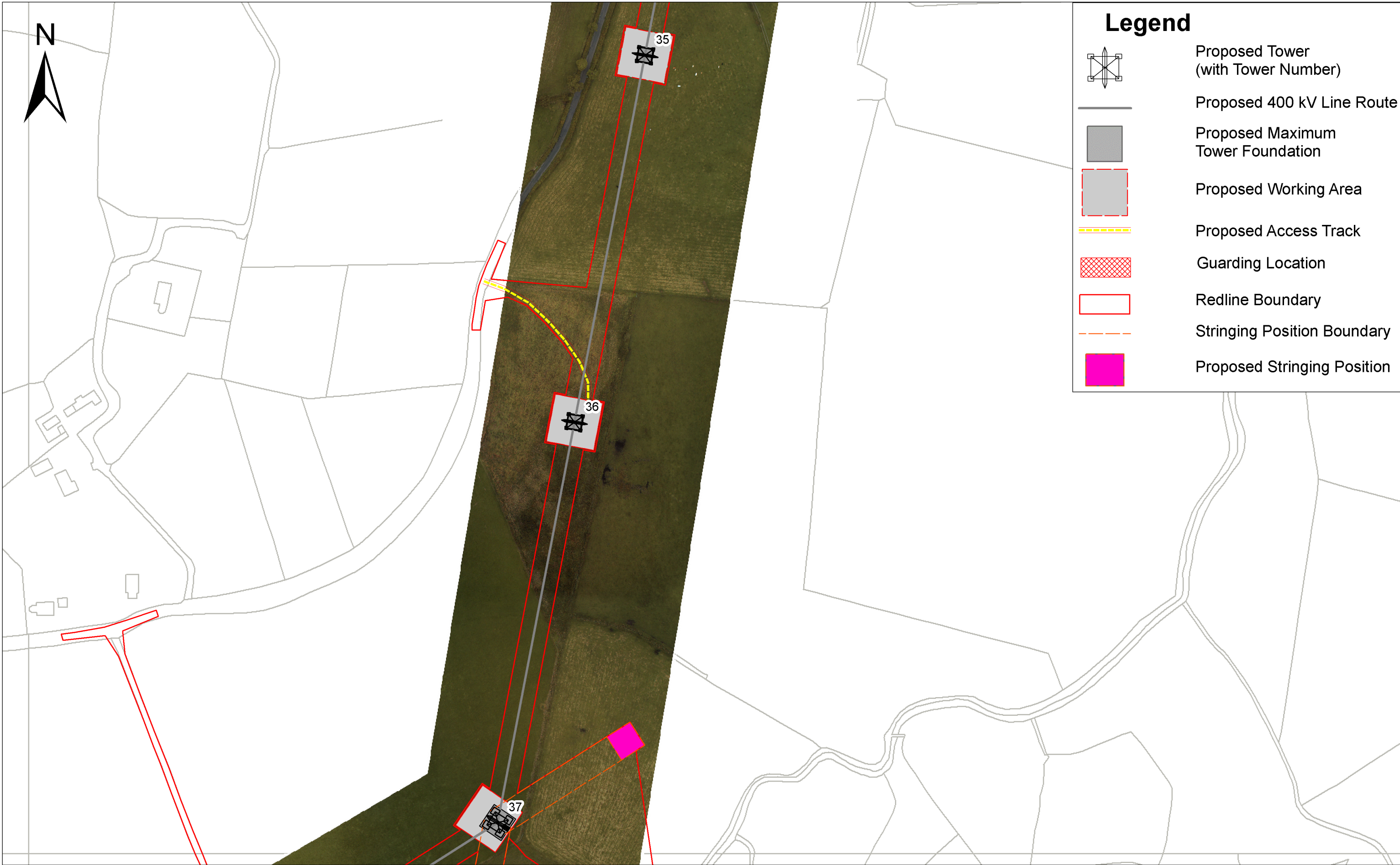
View 1: 1/2,500